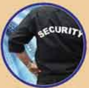
Round The Clock Automated & Manned Security