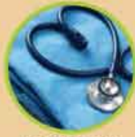
Medical & Health Facility