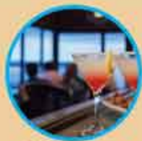
Club & Restaurants