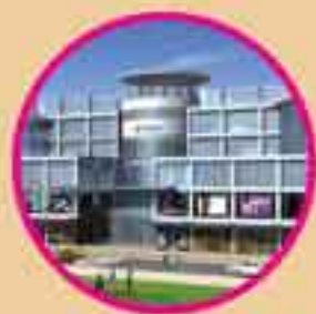
Shopping Complexes & Malls