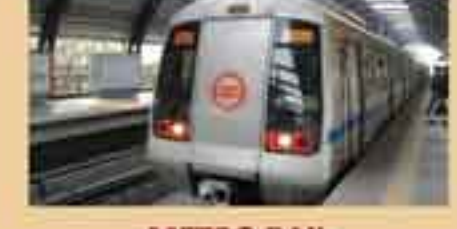
METRO RAIL OFFICE