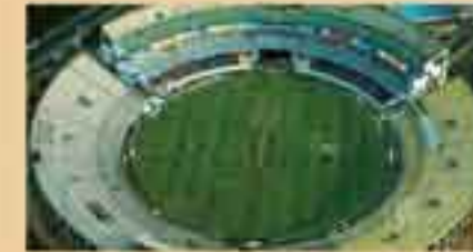
INTERNATIONAL CRICKET STADIUM