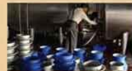
MILK PROCESSING UNIT