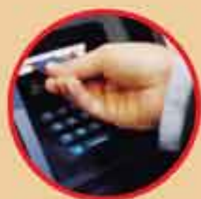
Bank & ATM Points