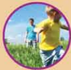
Park & Play Ground