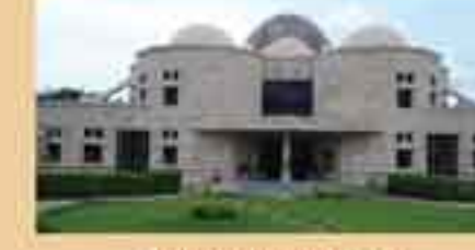
INTERNATIONAL INSTITUTE OF INFORMATION TECHNOLOGY