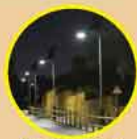
Solar Street Lights