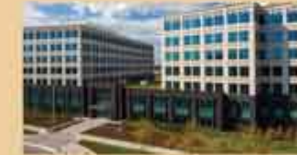
SUPER SPECIALITY CANCER INSTITUTE