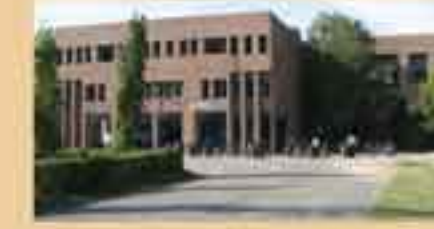
UP POLICE HEAD QUARTER

Imperative Landmarks Near Gomti Estate Phase - 3