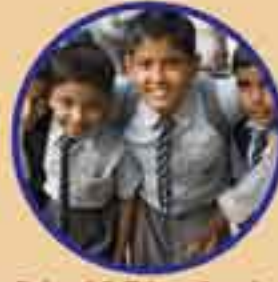
School & Educational Institutes